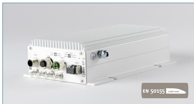
CyBox AP3-W with 10 GBaseT SFP. Pictures may be subject to change.