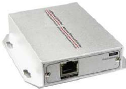
10/100/1000M PoE Extender 25.5W